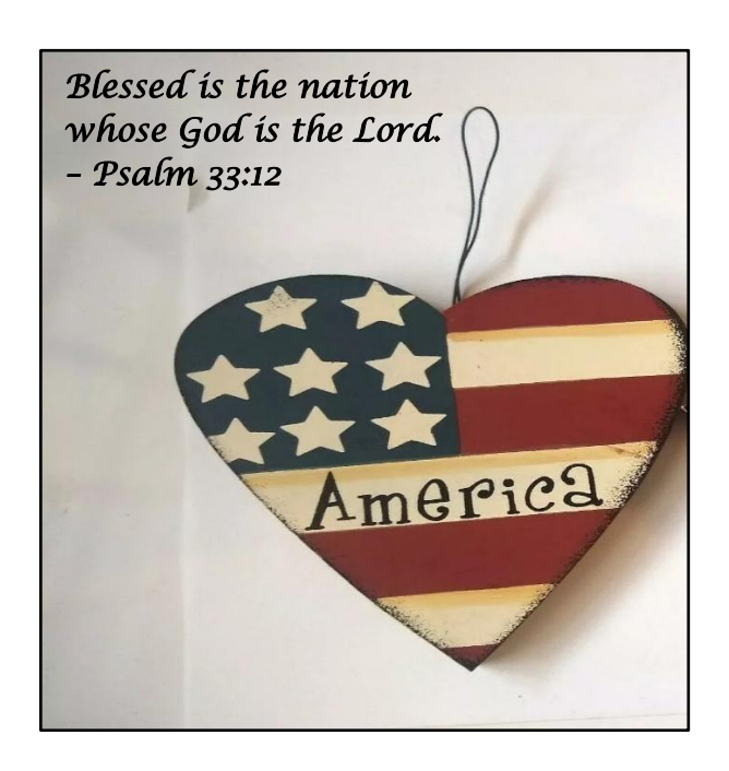
July 6, 2025 10:00 am

Combined summer worship schedule. Staffed Nursery, Wheelchair, Hearing Assist System & Large Print Bibles available. See the A/V booth for assistance. Children start in worship, then leave for classes.