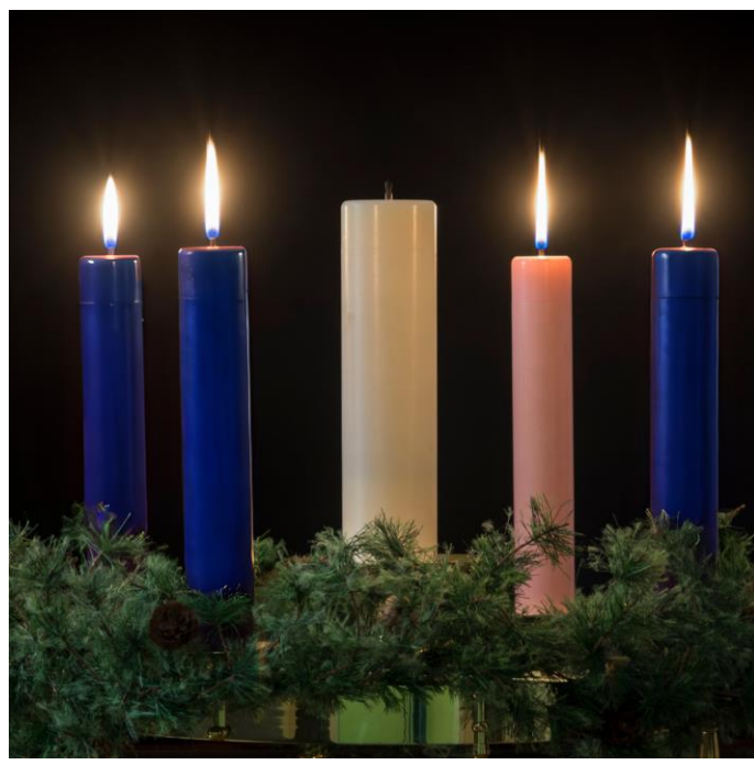
4th Sunday of Advent

From now on all generations will call me blessed, for the Mighty One has done great things for me-- holy is his name. Luke 1:48b-49