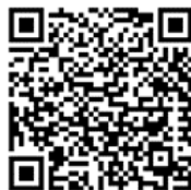
QR CODE FOR ONLINE GIVING

January 29 February 22 (Ash Wednesday) April 6 (Maundy Thursday) April 9 (Easter Sunrise only) April 23 May 28 (Pentecost) July 2 August 13 September 10 October 1 (World Communion) November 12 December 24